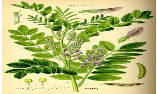
Figure 1: Glycyrrhiza glabra

Licorice with the scientific name of Glycyrrhiza glabra L. (Figure 1) is one of these plants. It is a perennial herb of fabaceae family which possesses a wide range of medicinal and food compounds in its root and rhizome. Licorice is widely used in medicinal, food and also tobacco industries. However, it grows easily so that it decreases products in farms and gardens due to high development of root and rhizome (Chandler, 2000). With regard to increasing value and special position of this plant in new medicinal industries, it is necessary to recognize its various potentials in different areas that is the aim of this review paper.